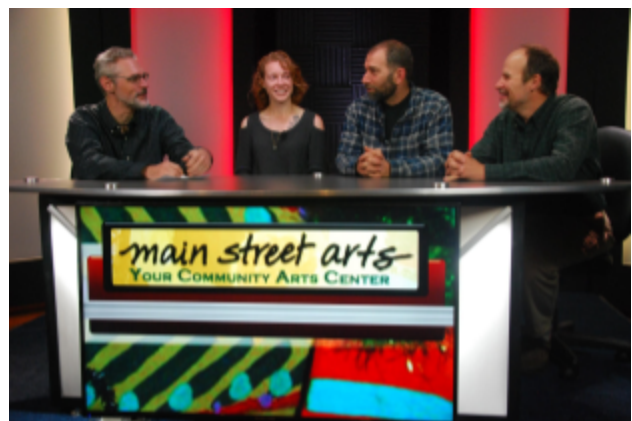
Performers from Main Street Arts of Saxton's River promote their upcoming performances on BCTV's Open Studio.

Town of Brattleboro Town of Dummerston Town of Guilford Town of Jamaica Town of Newfane Town of Putney Town of Townshend Town of Vernon Windham Central Supervisory Union Windham Southeast Supervisory Union