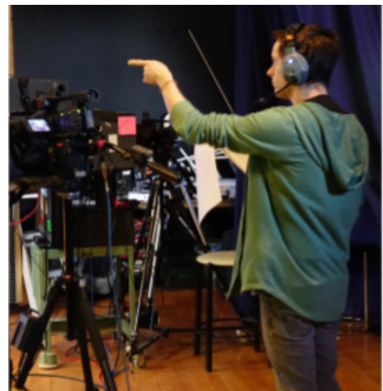
And...you're live! Landmark College Broadcast Journalism students practice the role of Floor Manager in BCTV's Studio.