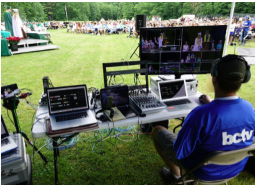
Leland and Gray graduation requires just about all of our gear to be on site.