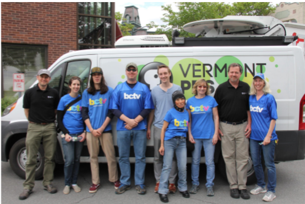
The crew relaxes after BCTV's production of The Strolling of the Heifer Parade went live on the main channel of VT PBS - a major broadcast network- for the first time in our history.

Fiscal Year 2017: July 1, 2016 - June 30, 2017