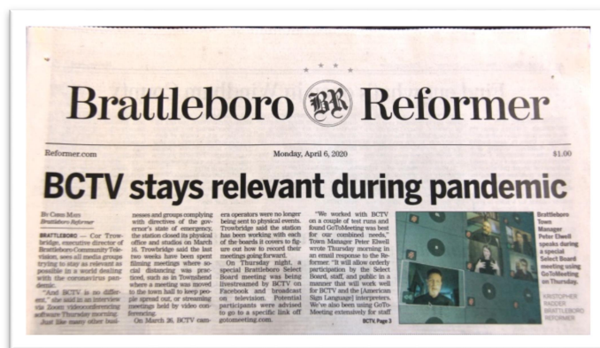
Brattleboro Reformer, April 6, 2020