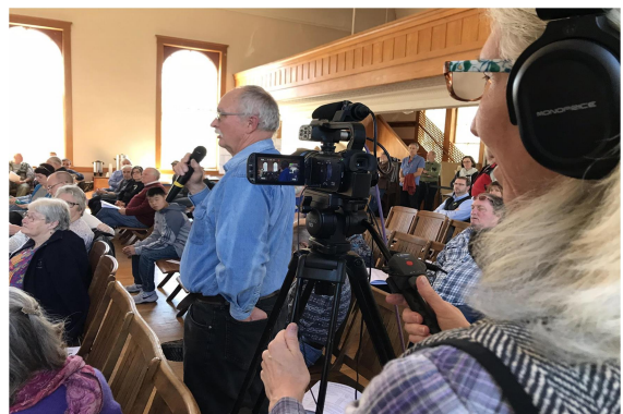
It takes the entire staff (even the E.D.!) to cover seven town meetings in two days.

Town of Brattleboro Town of Dummerston Town of Guilford Town of Jamaica Town of Newfane Town of Putney Town of Townshend Town of Vernon Windham Central Supervisory Union Windham Southeast Supervisory Union