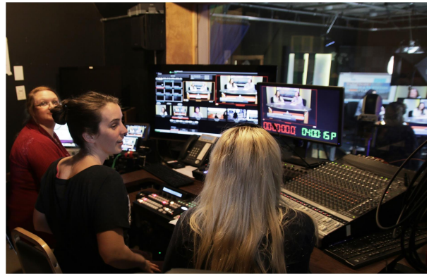
Leadership Southeast Vermont members in the studio.

Grace Cottage Hospital Groundworks Collaborative Guilford Community Church Landmark College Latchis Arts Lead Safe Healthy Homes New England Youth Theatre Putney Craft Tour School for International Training Strolling of the Heifers Turning Point of Windham County West River Valley Thrives Windham World Affairs Council The Winston Prouty Center Youth Services Inc.